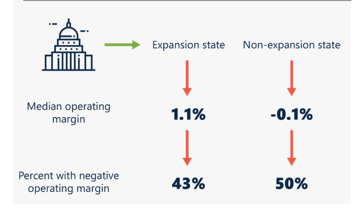
Figure 2: States that have expanded Medicaid under the Affordable Care Act outperform counterparts in non-expansion states.

minutes or more to reach the nearest facility.<sup>10</sup> Across the country, however, significant service deserts are emerging — and not just in areas in which a rural facility has closed. Between 2011 and 2018, our analysis reveals that 166 rural hospitals eliminated obstetrics (OB) as a patient service. This trend of rural hospitals eliminating OB to stay open has continued, and across the nation, 54 percent of all rural hospitals now lack OB services. This access is disappearing at the rate of 24 rural hospitals (communities) each year.<sup>11</sup> For women in communities that lose access to OB services, it means significantly more time in the car. In our 2019 analysis of drive times related to declining access to OB, we found that women in 59 percent of the communities that had lost OB services faced drives of up to 30 minutes more. Women in the remaining 41 percent faced drives of up to 60 minutes or more.