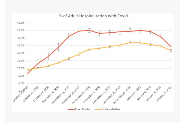
Figure 4: In mid-October, the percentage of adult COVID-related hospitalizations surpassed those of non-rural hospitals and quickly exceeded 30 percent.

This dramatic jump in COVID infection across rural communities has pushed capacity within the rural health safety net to its breaking point. Our analysis of data provided by the Department of Health and Human Services reveals from October 2020 to January 2021, rural hospitals experienced a higher percentage of adult hospitalizations from COVID — both suspected and confirmed — than non-rural hospitals (Figure 4). COVIDrelated adult hospitalizations at rural hospitals during this period increased from a median of 6.6 percent of all adult hospitalizations on October 16, 2020, to 34.2 percent on January 8, 2021. Among non-rural hospitals, the median